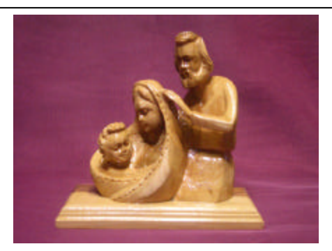
Bethlehem Christian Families Hard-carved Olive Wood