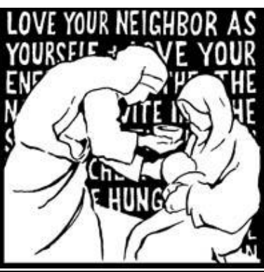
"Whoever has my commandments and observes them is the one who loves me ... and I will love him and reveal myself to him."