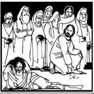
"Let the one among you without sin cast the first stone."