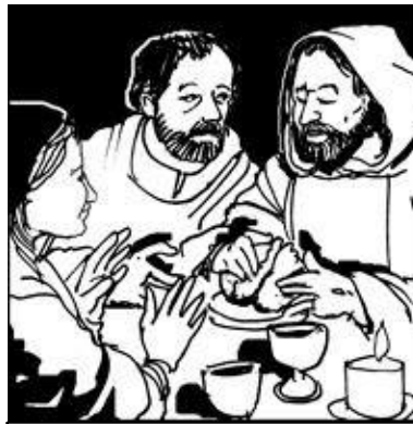
When he broke the bread, their eyes were opened and they recognized him.