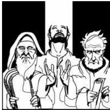
This is my chosen Son; listen to him. Luke 9:35

Name: _____ Address: _____ ZIP: _____ Phone: _____